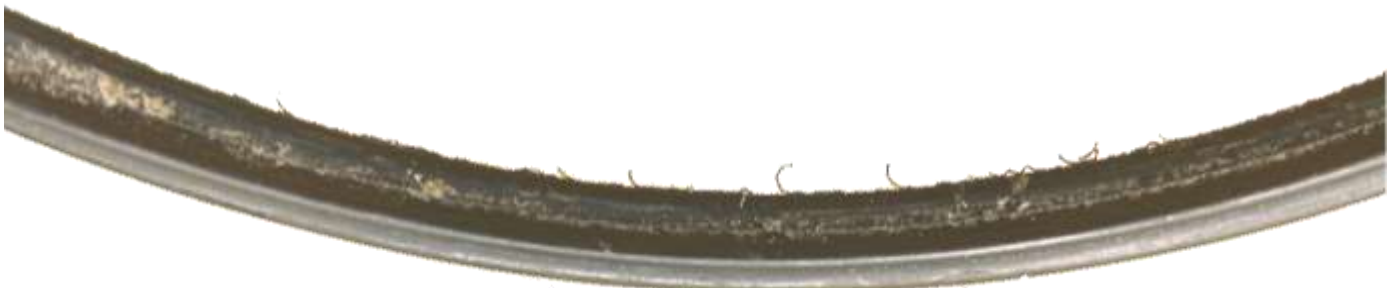
Figure 3: Section of the C-20 Seal that Failed