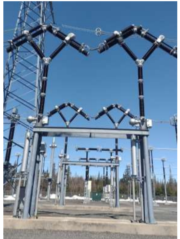
Figure 1: The Failed Air Blast Breaker

The maintenance team worked to isolate the circuit breaker. The intense cold made accessing the disconnect switches for manual operation unwise. The remediation took place the day after with the maintenance teams on location to find the most opportune time to work dependent on the temperature.